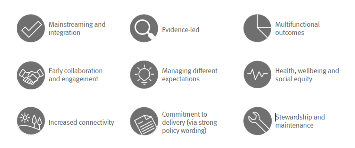
Figure 1: The Nine Essex GI Principles (Essex Green Infrastructure Standards, 2022)

This compendium aims to provide guidance, gathering key responses, and outlining clear expectations in order to assist local planning authorities in successfully securing and delivering high-quality GI from developments connecting to a wider GI/environmental network. This document is a collection, consolidation, and condensing of the collective knowledge of the ECC GI Team on high-quality GI infrastructure.